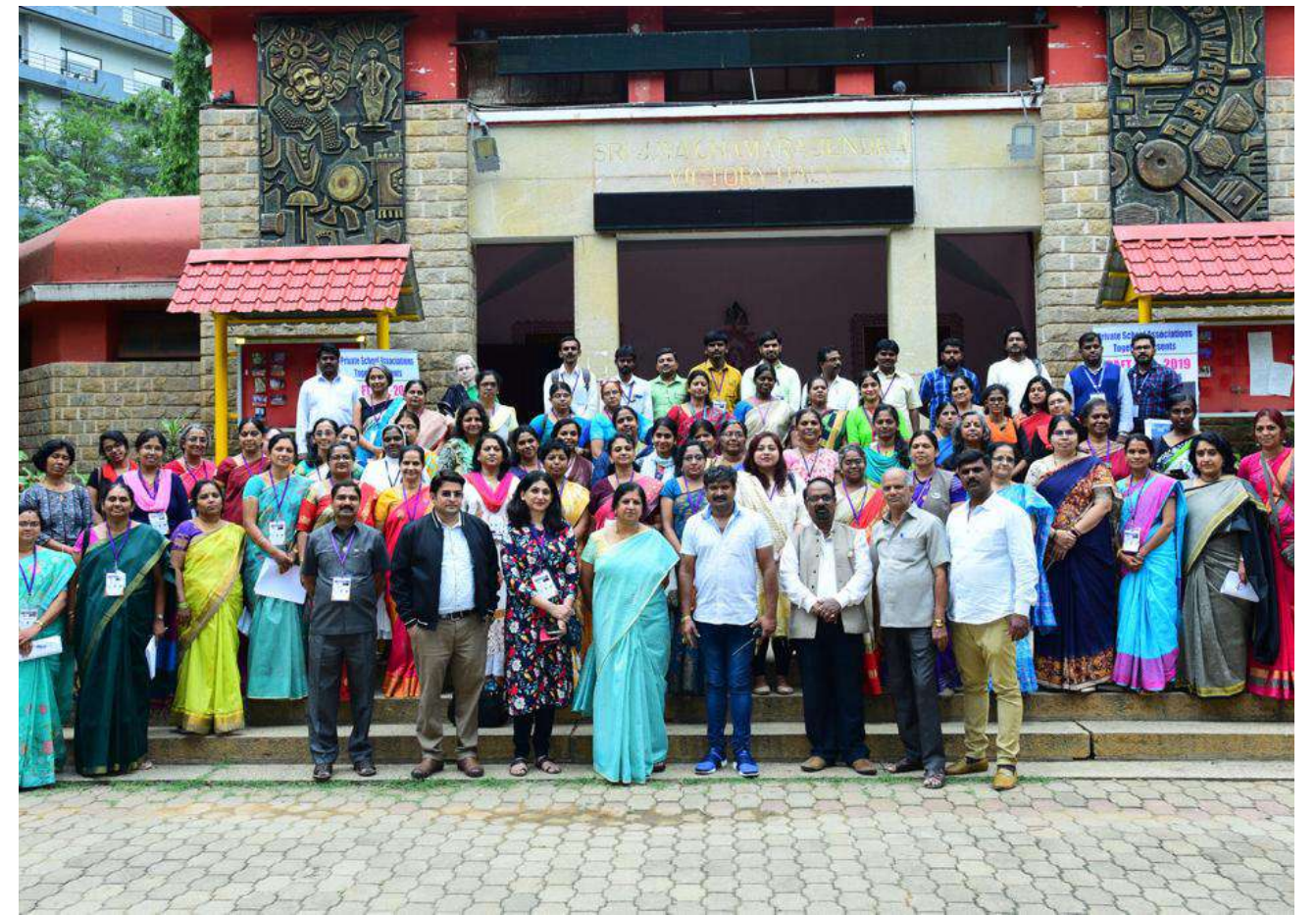
80+ teachers from 70+ schools at the NEP symposium