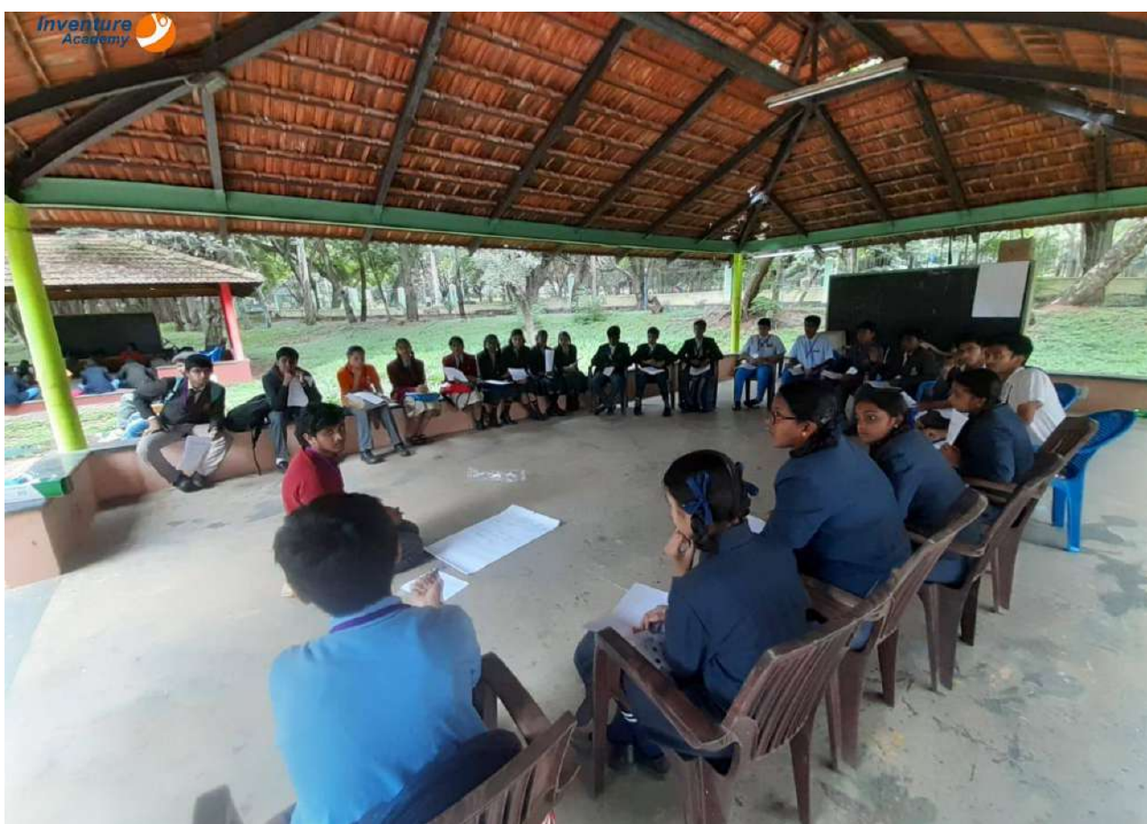
Inventure alumni & students facilitating break out sessions

In July this year, Inventure Academy in partnership with Karnataka ICSE Schools Association (KISA), Associated Management of Primary & Secondary Schools in Karnataka (KAMS), Management of Independent CBSE Schools Association Karnataka (MICSA) and Management Association of ICSE & ISC Schools (MAS) organised Our Future Our Voice , a day long symposium at Bal Bhavan, Cubbon Park.