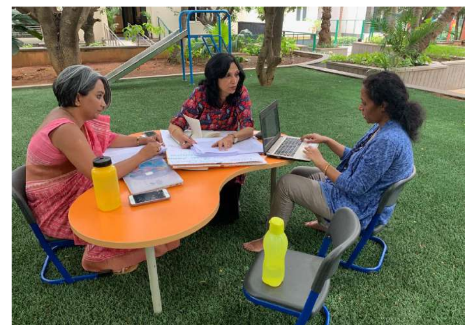
Inventure faculty, alumni & students working on Draft NEP Charter at Inventure Preschool Whitefield