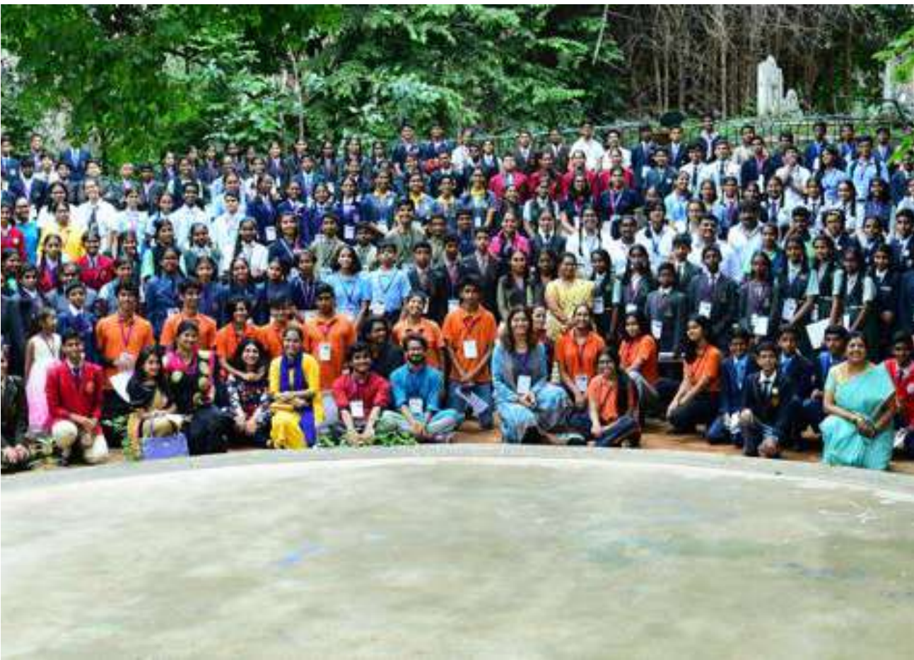
460 students from 70+ schools from various Boards of Education participated in the NEP symposium